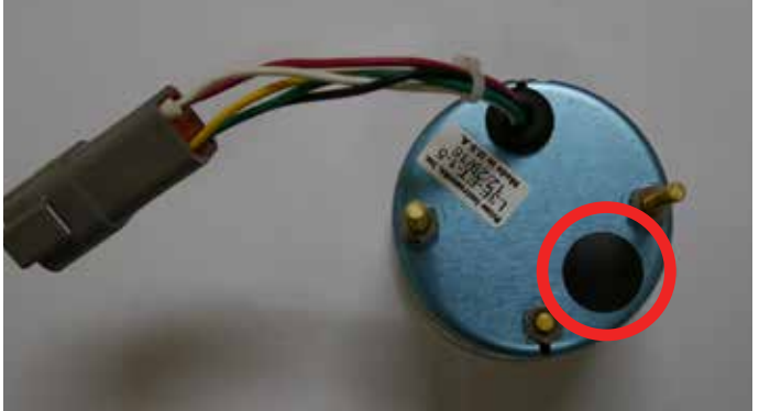
(Figure 1) (Figure 2)